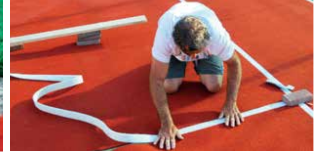
4_In Laid Line