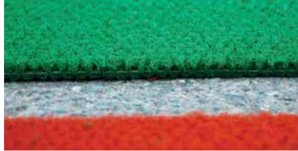
3_In Laid Line